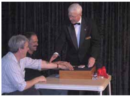
A Karate chop for an unruly spectator!